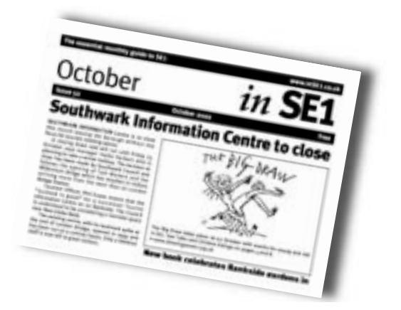
How we covered the closure of the Southwark Infomation Centre in our October 2002 issue.

SOUTHWARK COUNCIL is opening a Tourist Information Centre in the Vinopolis attraction opposite The Anchor on Bankside.