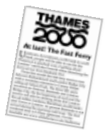
How we reported the launch of the Fast Ferry in our June 1999 issue

The service reduction, which leaves Bankside Pier without a scheduled river service, comes as the String of Pearls Millennium Festival brochure promotes the White Horse