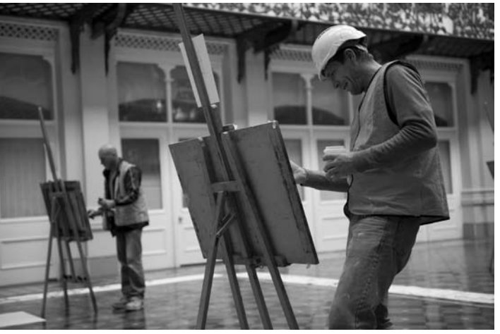
London's largest line drawing at the Hop Exchange as part of Drawn to Bankside last year