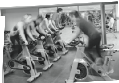
CLASSES AVAILABLE ALL DAY LONG!