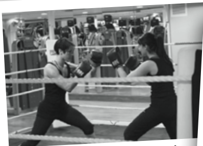
BOXING - FOR BOYS & GIRLS!

To take advantage of this fantastic offer call 0207 921 9343 - alternatively email info@thebanksidehealthclub.co.uk