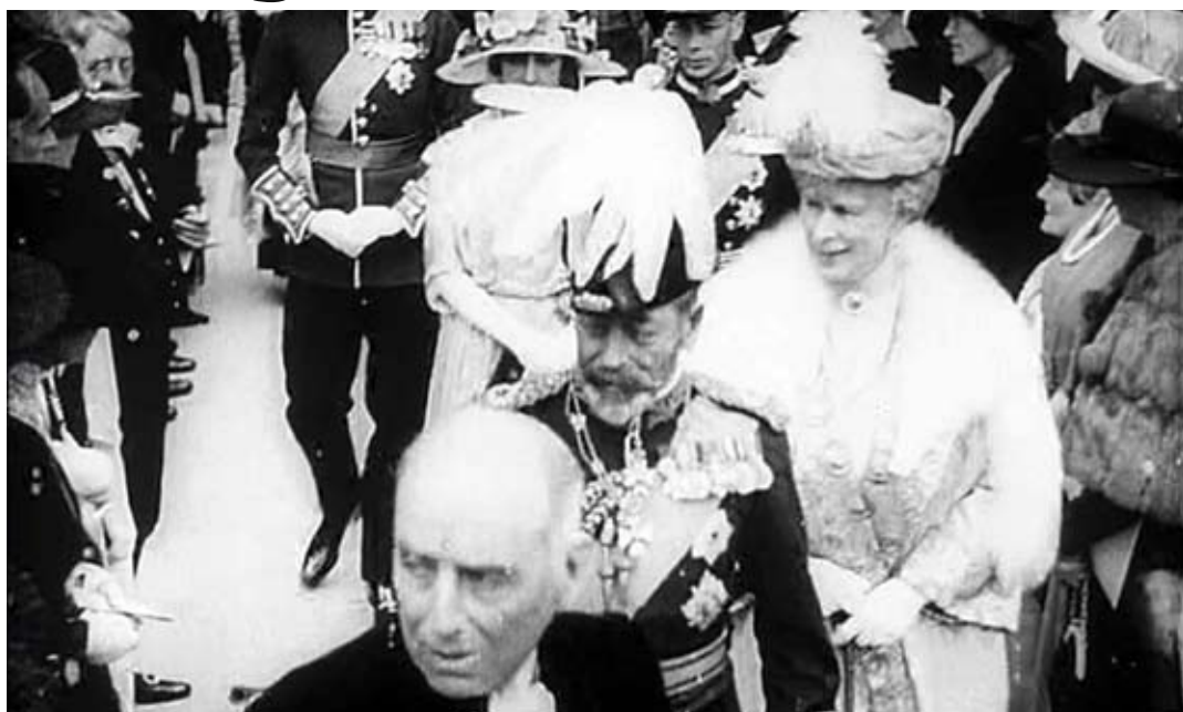
Newsreel footage of the opening of County Hall on the South Bank is amongst the historic film of Lambeth and Southwark that can be seen at BFI Southbank's Mediatheque this month.

On 18 June The Elephant in Time in NFT1 features rare footage of the Elephant & Castle in the 1920s, recently unearthed in the BFI National Archive (see listing on page 6). This event aims to tell the Elephant's story,