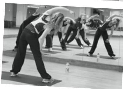
BEND IT - STRETCH IT!