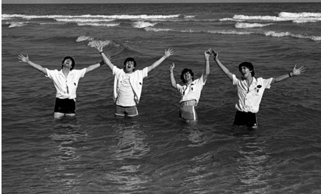
The Beatles pose in the sea at Miami Beach during the band's tour of America in 1964.

The Getty Images Gallery will this month open a permanent new photographic exhibition space at the Movieum of London in County Hall.