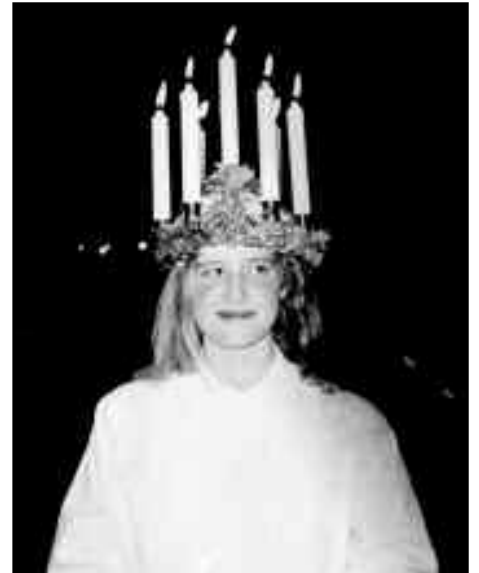
St Lucy's Day on Friday 13 December will be celebrated at Southwark Cathedral with a Swedish Santa Lucia Service. See page 8 for details.

Earlier this autumn Prince Charles visited nearby Southwark Cathedral • www.princeofwales.gov.uk