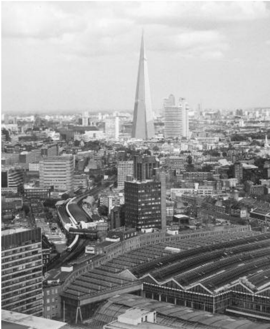
Artist's impression of the view of the London Bridge Tower from Waterloo

RESIDENTS IN Hampstead and Highgate are outraged at Southwark Council's surprise decision to give the go-ahead to London Bridge Tower. The 66-storey block, Europe's tallest building, will transform the skyline say north Londoners.