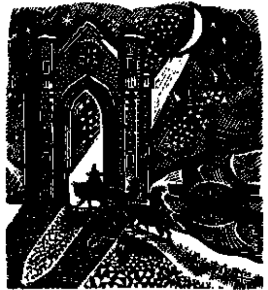
Three Kings woodcut by John Lawrence.

Work by John Lawrence can be seen at Season's Greetings , a mixed exhibition of watercolours and original prints by members of the Royal Watercolour Society and the Royal Society of Painter-Printmakers, at the riverside Bankside Gallery in Hopton Street. All work is for sale and can be taken away on the day of purchase. See listing page 5.