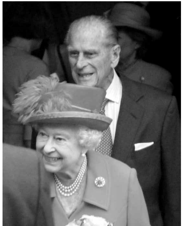
The Queen and Duke of Edinburgh pictured at the National Theatre last month. On Tuesday 19 November Prince Philip will visit Bankside to open the new Sam Wanamaker Playhouse at Shakespeare's Globe. Two days later he will return to SE1 with the Queen to visit Southwark Cathedral.

• After the Borough High Street service the Mayor of Southwark will travel to Geraldine Mary Harmworth Park to take part in an Act of Remembrance at the Soviet War Memorial.