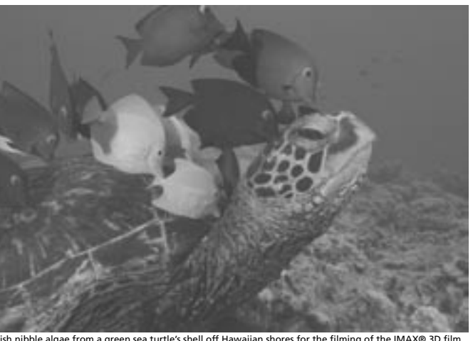
explores Reef fish nibble algae from a green sea turtle's shell off Hawaiian shores for the filming. Deep Sea 3D.

Alongside the amazing cinematography of Deep Sea, Danny Elfman creates an original score