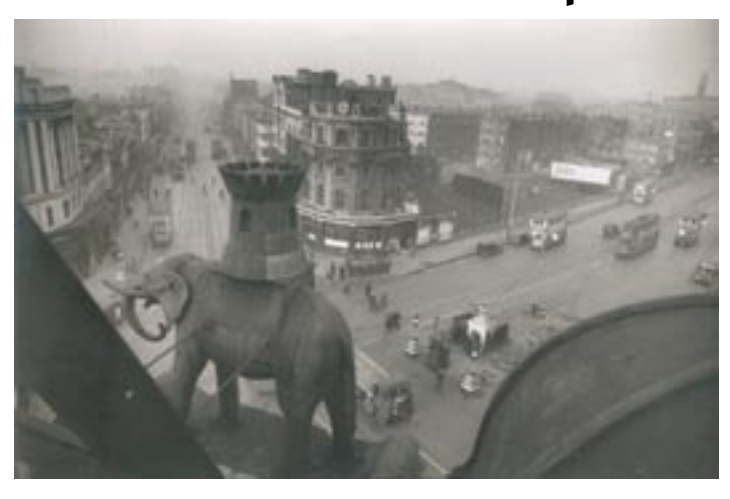
SEE page 5 for details of an exhibition of Bert Hardy's photographs of the Elephant & Castle