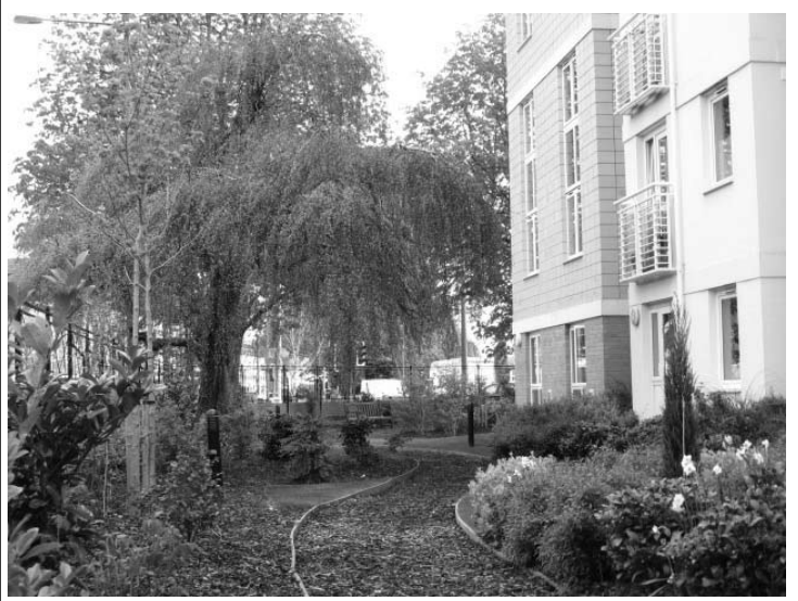
To qualify, residents must be aged 60 or over, on low incomes with modest savings and have lived in Southwark for 3 years.