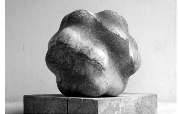
Untitled by Peter Randall-Page