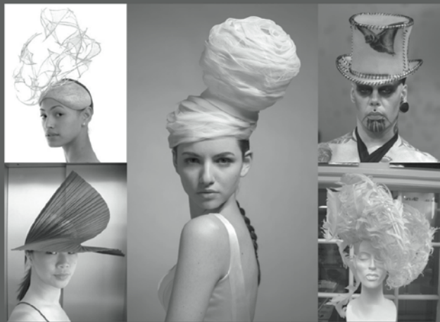
A unique exhibition with its focus on a new era of 'head dressing'